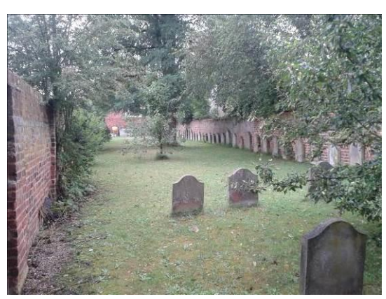
Statement of Significance

The building has high significance as a good example of an early nineteenth-century meeting house built on the site of an earlier one, retaining a little-altered interior with historic gallery and fittings, and sensitively extended. The burial ground is also of high significance.