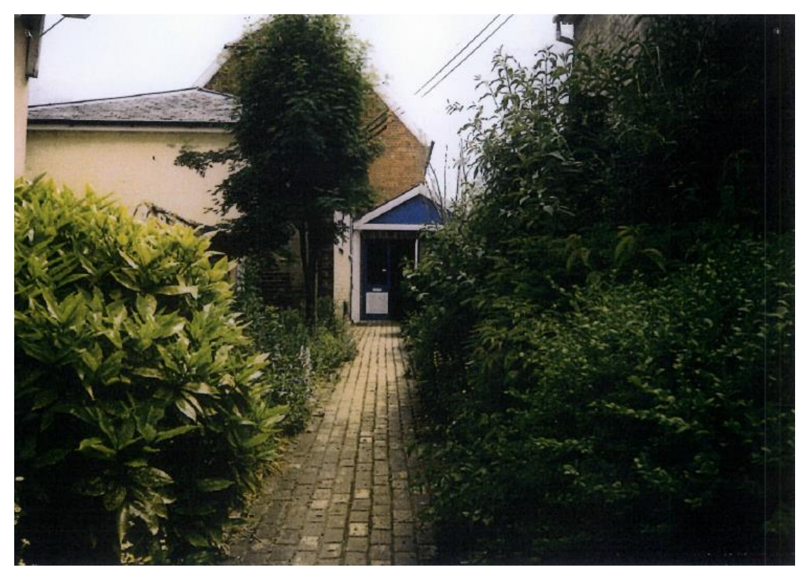
Figure 2: The approach to the meeting house before the 2012 alterations